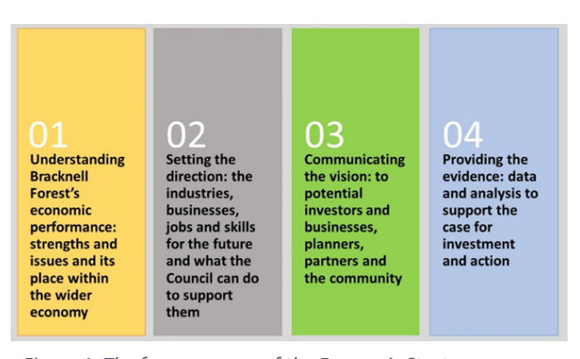
Figure 1: The four purposes of the Economic Strategy